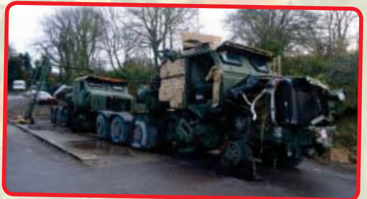
Heavy Accident Work

Well they came to stay with us for some modifications, being fitted with steam generators they can drain the liquid chocolate out so any thoughts of having to dig them out were shattered. That's life I suppose we only get to dig out bitumen, cement and solid flour!