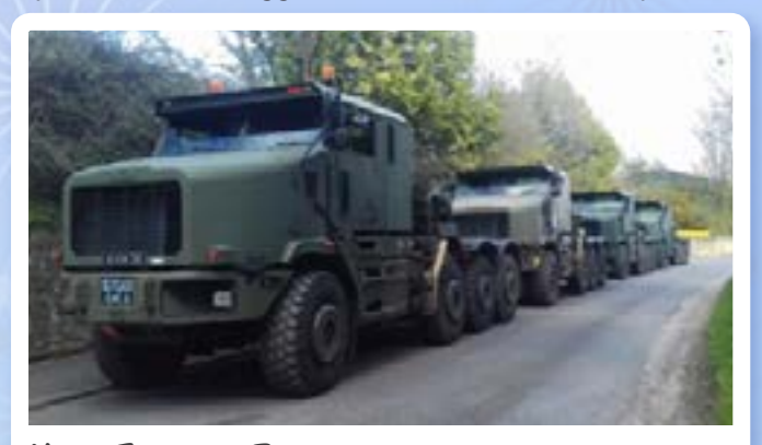
Heavy Equipment Transporters