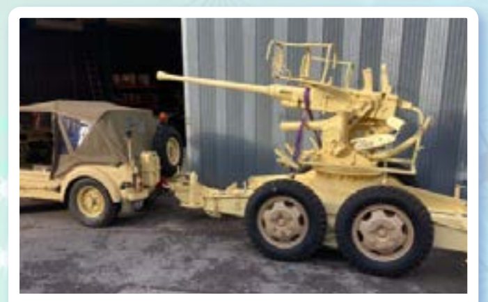
Bofors Anti Aircraft

A wartime Bofors gun, totally seized, now nearly ready to join the Bruton Expeditionary Forces Artillery Platoon.