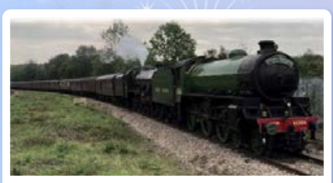
Water Stop at Bruton Central

in the middle of the yard. Arrogantly, thinking it was there for us to repair, the driver was accosted, but was here to refuel a steam train on an excursion. Eventually establishing that the train was due west and not east we moved him to the other side of the tracks. This 12-carriage train stops in our station (and was double header, 61306 Mayflower and 45596 Bahamas), neither of which we have seen before – I reckon it's the first steamer to stop in Bruton since my teenage years. Pulling out sounded fantastic and recorded for posterity.