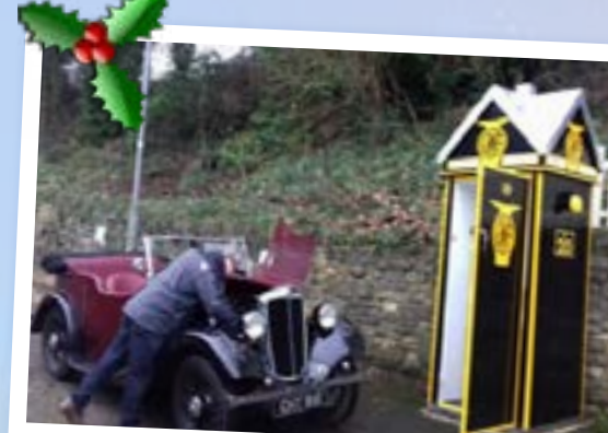
In Days of Yore

Off the wall projects we engaged with throughout covid, was to remind the older generation of a by-gone age... The provision of an AA box on the station approach took me by surprise