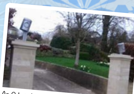
An Ode to Internal Combustion

Another was an "educational" statement for future generations (when we all drive electric cars!), as a memory to the internal combustion engine. This being two large marine