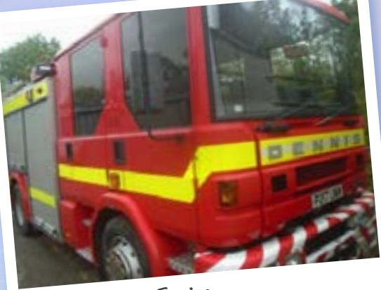
Rejuvenated Fire Engine

Any avid readers will know that we survive on adrenalin the that projects provide us (and drive us mad). Amazingly these challenges keep coming. Varying "straight from forward" "please find a