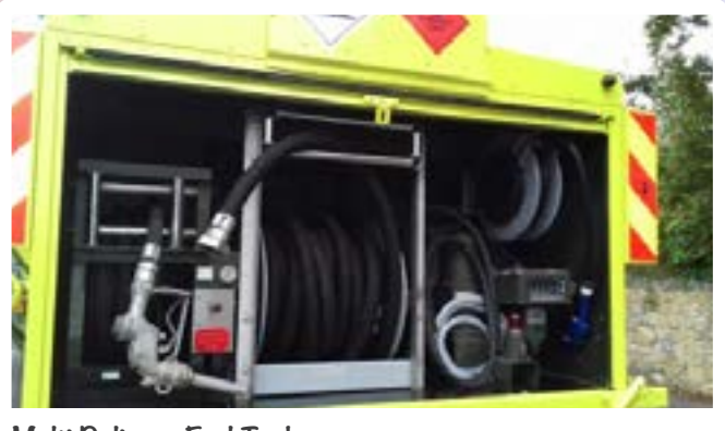
Multi Delivery Fuel Tanker

overhaul the mechanics, paint it bright and light up like a Christmas tree. Aluminium, stainless - No Problem....!!